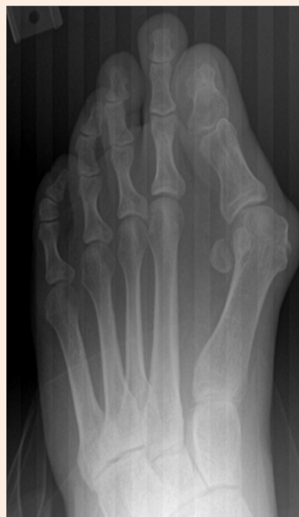
Figure 3: X-ray before surgery.

Akin osteotomy was selected as the adjunct procedure to further enhance patient satisfaction. The benefit of Akin osteotomy is to produce a straighter toe, which is a desirable trait for patients. Akin osteotomy allows for better alignment of the hallux and more natural range of motion.