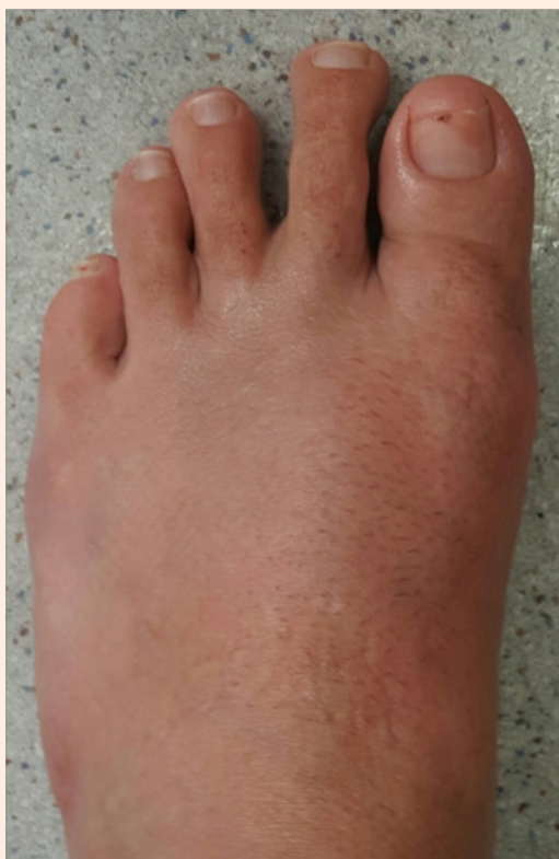
Figure 2: After surgery.

Attention was directed to the hallux to perform the Akin osteotomy at the proximal phalanx. A small wedge was resected from the medial aspect with the base medially and the apex. The Akin osteotomy was fixated using a standard compression staple.