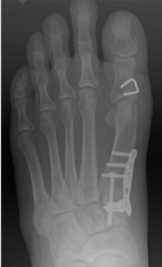
Figure 4: X-ray after surgery.